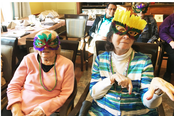
Members dancing and enjoying the Blue Rocket Boys.