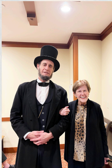
Photos with Mr. Abe Lincoln.