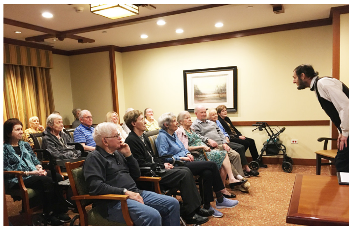
Mr. Abraham Lincoln made a visit for our Members.