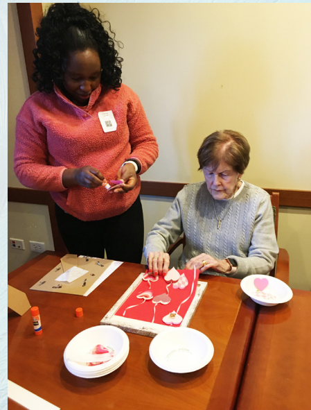
Working hard during our craft.