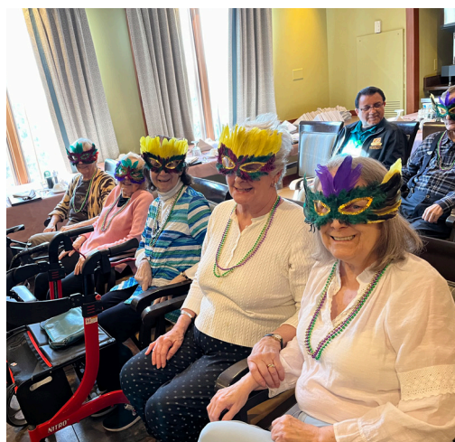
Members ready for Mardi Gras!