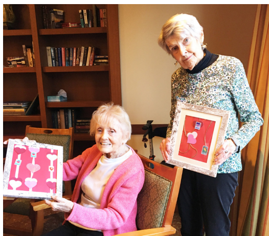
Finished product of our Valentine's Day craft.