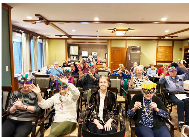
Prairieview Members enjoying themselves at Mardi Gras!