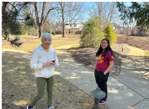
Members taking a walk with beautiful weather.