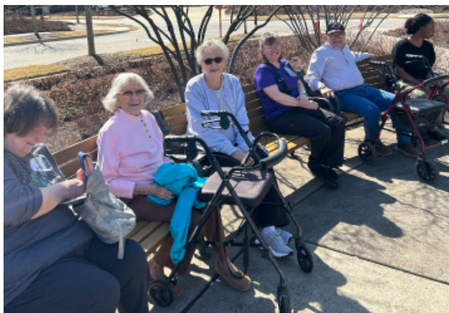
Enjoying the weather!