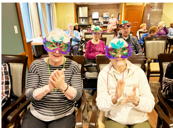
Members having fun at a Mardi Gras party!