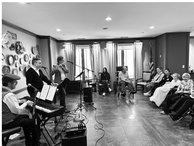
Irish Tenor Gavin Coyle

project that everyone will enjoy! Transform colorful paper into blooming masterpieces that'll brighten any space—no green thumb needed!