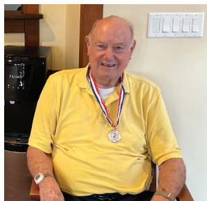
Table Top Bowling Winners