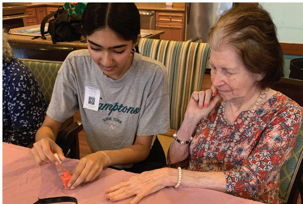
Makeovers with the Glamour Gals