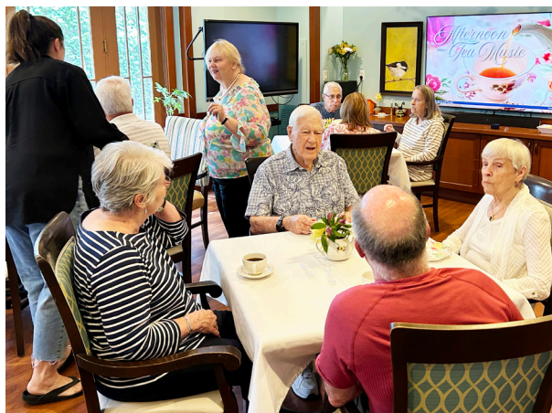
Memory Enhancement Mother's Day Tea.