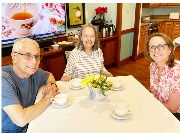
Members enjoying each other at Mother's Day event.