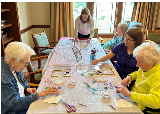
Working on our craft.