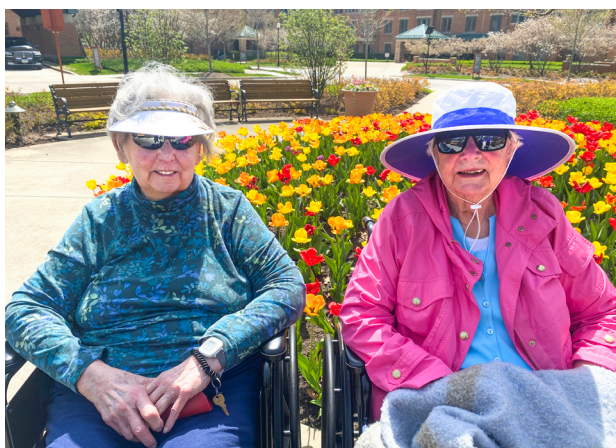
Friends enjoying the outside.